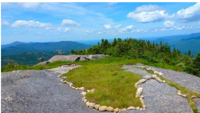
Restored Vegetation, Cascade summit