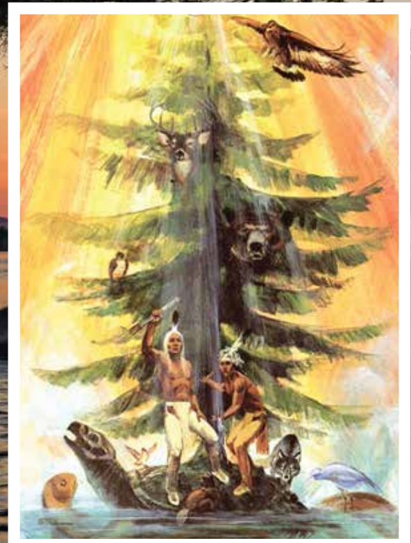
“The Iroquois Tree of Peace” by Oren Lyons, Onondaga