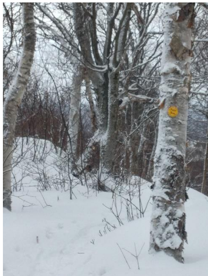
Trail to St. Regis