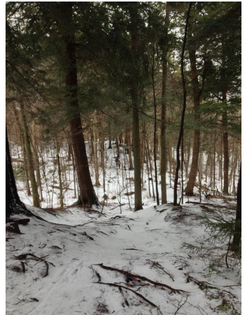
Jack Rabbit Trail, Lake Placid.

The Loj is a great place midweek because it's quieter, less crowded, and there are always other people there to meet and hike with. There are many activities to do right out the front door or just a short drive away, from cross country