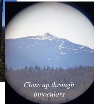
Close up through binoculars