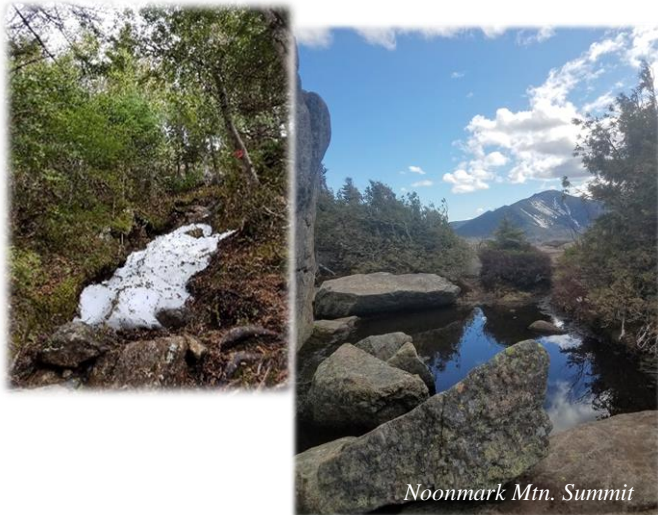
Noonmark Mtn. Summit