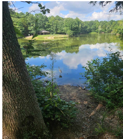
Three Lakes Park and Nature Center, Ashland, VA