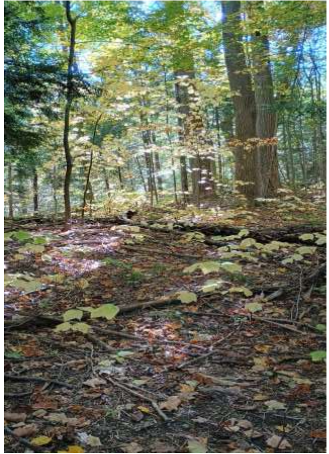
Hike in Zoar Valley