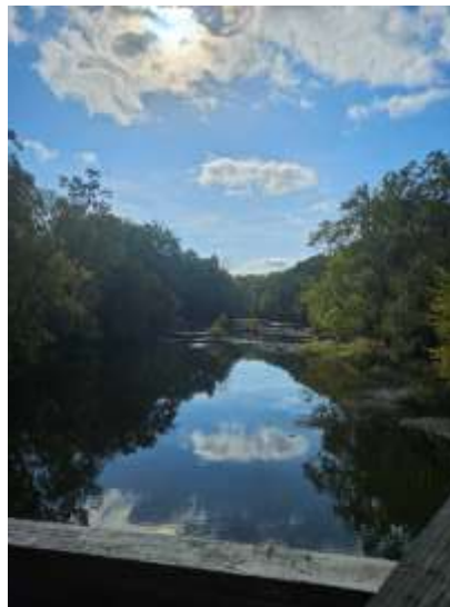
Geneva, OH